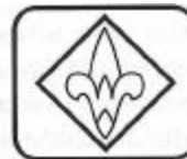
Webelos Scout slide